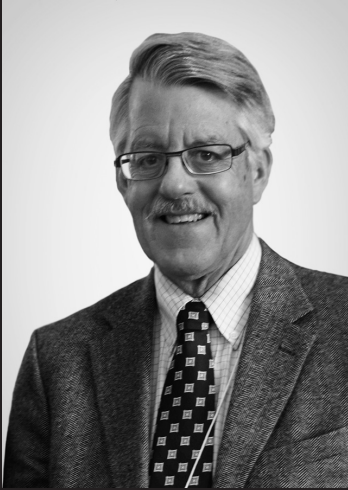
NEA's own Alex Trebek

NEA is hosting its own version of the famous television game show Jeopardy. Participants will be tested on their knowledge of NEA history, collections in local New England repositories, fun historical facts, and the representation of archives and archivists in pop culture.