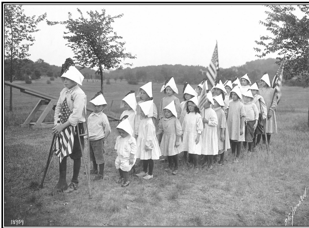
Fourth of July Parade, circa 1910.

In the early days of Children's Hospital Boston a sanitarium was established in the country to care for convalescents. "It was thought that much advantage would result to patients giving them change of scene and air, and that diseases which had failed to respond to medical treatment and good regime alone, would be hastened to a cure by these agencies." Children's Hospital Annual Report , 1874. As the hospital grew, the need for non-acute long-term care for the patients increased. Responding to this need, the hospital's Ladies' Aid Association rented a small house in Weston, Massachusetts and opened it as a convalescent home for children in 1874. The children in this image were patients at the home, participating in Independence Day festivities. Image courtesy of Children's Hospital Boston Archives.