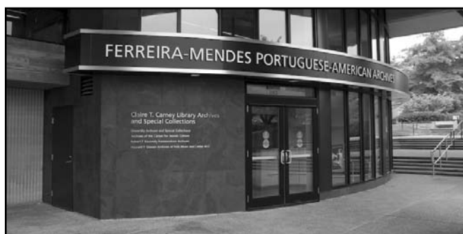
Entrance to the Archives and Special Collections

Renovation plans began in 2004 when attention turned to an underused section of the Claire T. Carney Library formerly inhabited by the university's television studio and later by the North American broadcast center of RTP1, Portugal's national public television. A large television studio on the basement level of the library was retrofitted with compact shelving and climate control. The mezzanine level, once the control room of the studio, was renovated into a reading room. An office near the entrance became a gallery with nineteen locked display cabinets, and other areas of the former audiovisual department were renovated into offices and a processing area with ample counter space and storage cabinets. Many of these spaces, including indi-