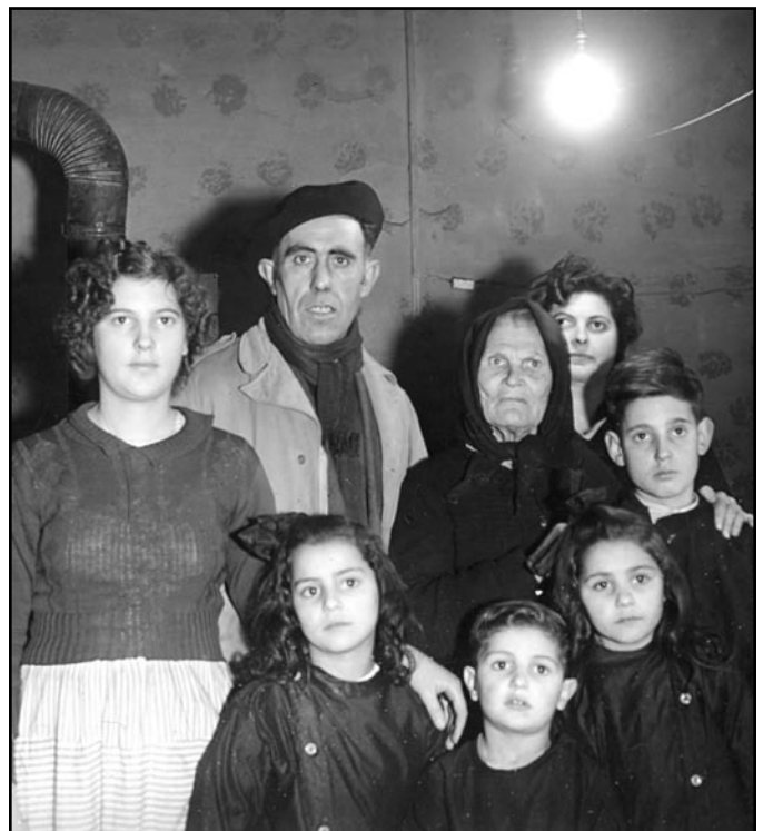
Spanish refugees in a center established by the Unitarian Service Committee in Toulouse, France.