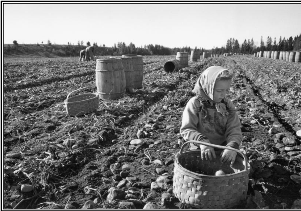
Girl harvesting potatoes, 1954.