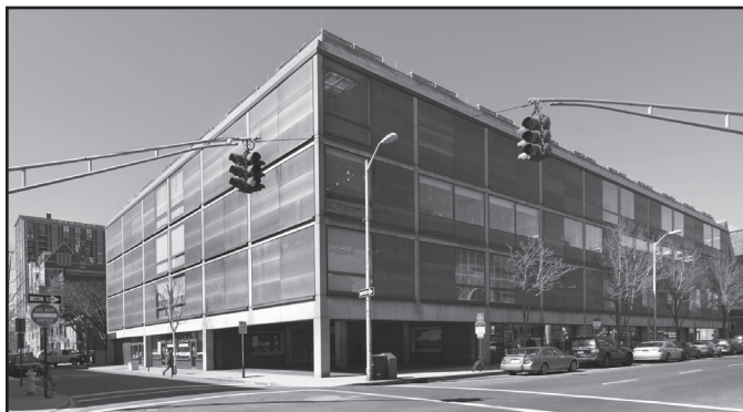
The Yale Center for British Art (YCBA).

This project will demonstrate how existing digital preservation tools and strategies, typically only employed by archivists and digital preservation managers, can transform current practices used by museums to manage and preserve their growing collections of born-digital records. The lessons learned will provide a model for other museums regarding the management and preservation of born-digital historical records held by multiple departments. For more information contact: <catherine.peebles@yale.edu>.