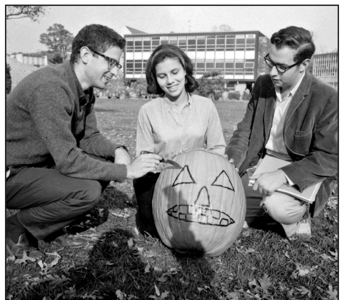
Brandeis University students celebrate Halloween by taking a stab at pumpkin carving. This image, taken in 1963, comes from the University Photography Collection.

Desegregating the Past gives its readers much to think about, and the fact that it supplies more questions than answers is not a criticism. Controversies in this country such as white supremacist violence and the continuing disputes over Confederate monuments tell us that past, present, and future continue to be closely entwined; “slavery fan fiction” will be with us for some time to come. ■