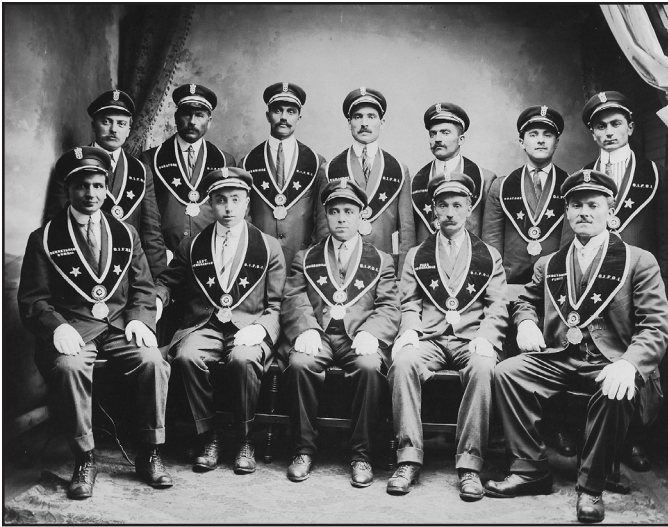
Members of the Figli d'Italia (Sons of Italy), Lodge 52, Order Independente, of Leominster, Massachusetts, pose proudly for a group photograph taken for the time capsule deposited in cornerstone of the Leominster Municipal Building during the town's 175th anniversary festivities in 1915.

and publications going back to the 1940s that document the chapter's efforts to encourage local citizens to become active and informed members of the community. Malme created a detailed inventory of the thirteen-box collection which he arranged for the League to donate to the Society in July. The League collection was the first large-scale donation received by the Society since they moved back into their newly renovated headquarters. The expanded Old Derby Academy building now houses a permanent museum space to display its many collections and an environmentally controlled archives and reading room available to researchers and the public. For more information, visit the Society's website: < www.hinghamhistorical.org >.