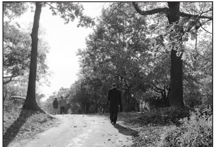
Students walk amid autumnal splendor on the Brandeis University campus, fall of 1952.