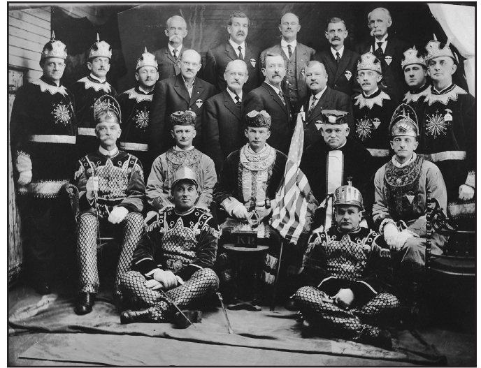
Members of the Knights of Pythias, Columbia Lodge, No. 100, of Leominster, Massachusetts, pose in full regalia for this photograph taken for the time capsule that was placed in the cornerstone of the new municipal building during the town's 175th anniversary celebration in July 1915.

The time capsule was placed in the cornerstone of Leominster's Municipal Building on July 5, 1915, during a