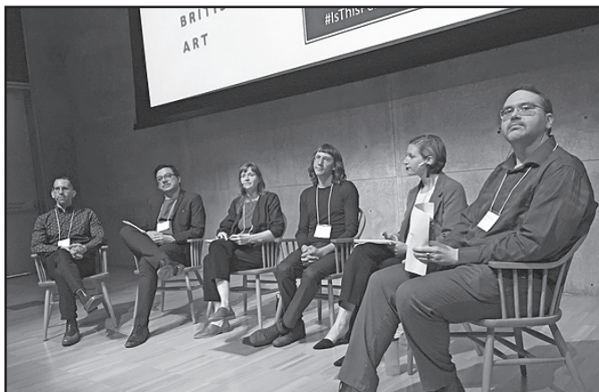
Morning speakers at, “Is This Permanence: Preservation of Born-digital Artists' Archives.”

For more information, contact Cate Peebles at < catherine.peebles@yale.edu >.