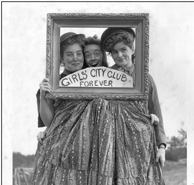
Field Day at Kay Lovett's Farm, 1940. The Girls' City Club of Providence (MSS 438), Rhode Island Historical Society. The Girls' City Club of Providence was founded in 1920 to "Promote good fellowship among girls, developing their social, educational, and recreational opportunities and increasing their power and opportunities for service through the medium of non-sectarian and self-governing organization." The club was active until its closure on March 8, 1970, after fifty years of service.

The Rhode Island Historical Society has recently put resources and staff time into creating a display system which will allow a range of interpretation in our small exhibition space in downtown Providence. The window display (facing Westminster Street) is on the outside of the historic Arcade, built in 1828, just six years after the RIHS was founded. The system is a set of stackable cubes in three sizes, with magnetic backings, which will allow flexible arrangements of images and text to highlight our collections, publications, and events. The first display will promote the feature article in the next issue of our peer-reviewed journal, Rhode Island History , on the history of the Narragansett Pacer, one of the most popular breeds of horse in America in the seventeenth and eighteenth centuries. The late summer display will highlight the Girls' City Club of Providence, a recreational club for young women that was active between 1920 and 1970. For questions, please contact Michelle Chiles, Research Center Manager, at <reference@rihs.org>.