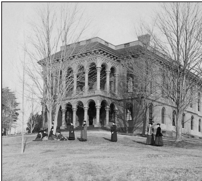
Normal Hall School Building, 1853-1889, was the first building to be built on the Framingham Campus. It housed classrooms and the administration, and was located where May Hall stands today. The Normal Hall School Building was moved as it fell into disrepair, and was demolished in 1889 once May Hall was constructed.