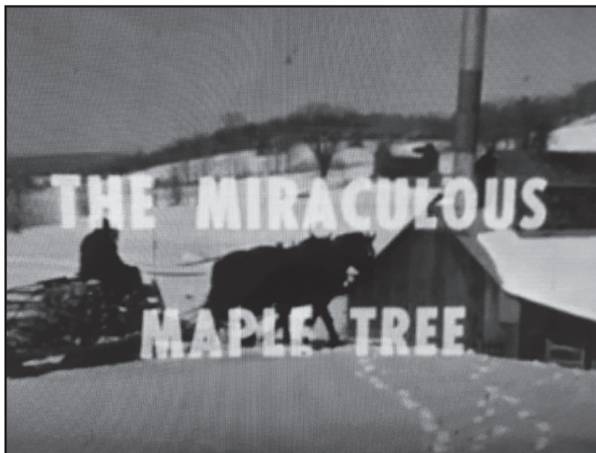
A still image from the opening scene of the 1966 film The Miraculous Maple Tree.