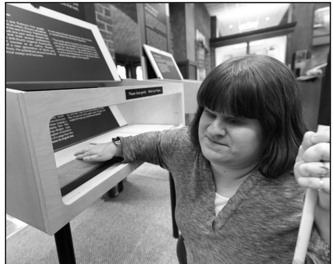
A visitor exploring a 3-D printed artifact in the Touch This Page exhibition.

The roadmap will be flexible enough to allow libraries to enter at their current point of need, whether they are navigating the complexities of community partnerships, planning digitization events, providing access to archived items, or preserving digital images long term. By using the roadmap as a guide, libraries across the country can em-