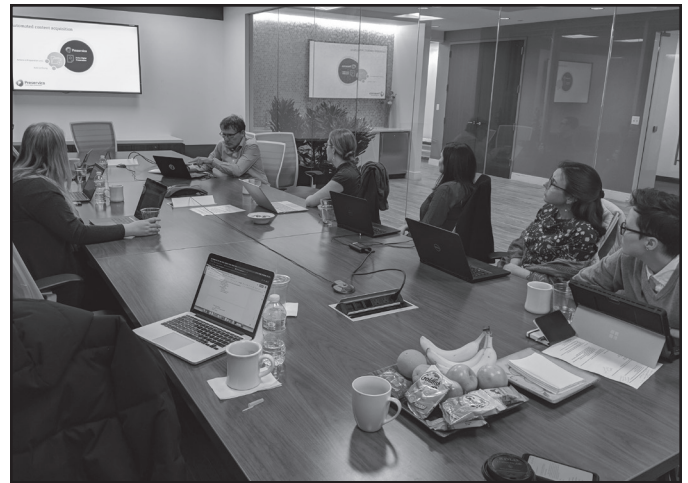
The Preservica Roundtable held an in-person user group meeting at the Boston Preservica offices in May.