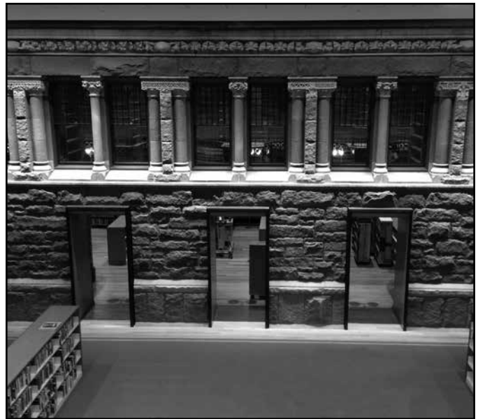
View from the mezzanine of the new Woburn Public Library building.

The Dr. Thomas J. Glennon Archives reopened to the public on March 16 during the Woburn Public Library's grand opening at the new library building at 45 Pleasant Street in Woburn, Massachusetts. The building