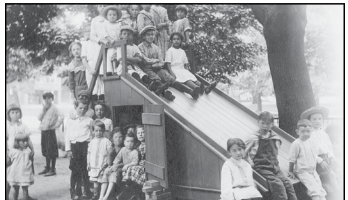
A Day in the Park, undated. Children play on the Cellar Door Slide in Bushnell Park, Hartford, CT. Date unknown.

In the library part of my career, convincing administrators and funders that libraries are more, not less, necessary in this age of nearly boundless access to information on the internet. In switching to the world of archives, I find the emphasis is more on preserving and maintaining a relatively static collection. In school and public libraries the collection is an ever-changing reflection of the interests of the community, with worn or dated materials sometimes repaired or replaced, but often discarded. The more current the nonfiction collection, the better; in archives, the older material carries more of a badge of honor. The cost of materials for preservation and conservation can be a little shocking, and it's not especially visible; the equivalent of replacing your furnace at home—it's got to be done but not something you post on your Facebook page. ■