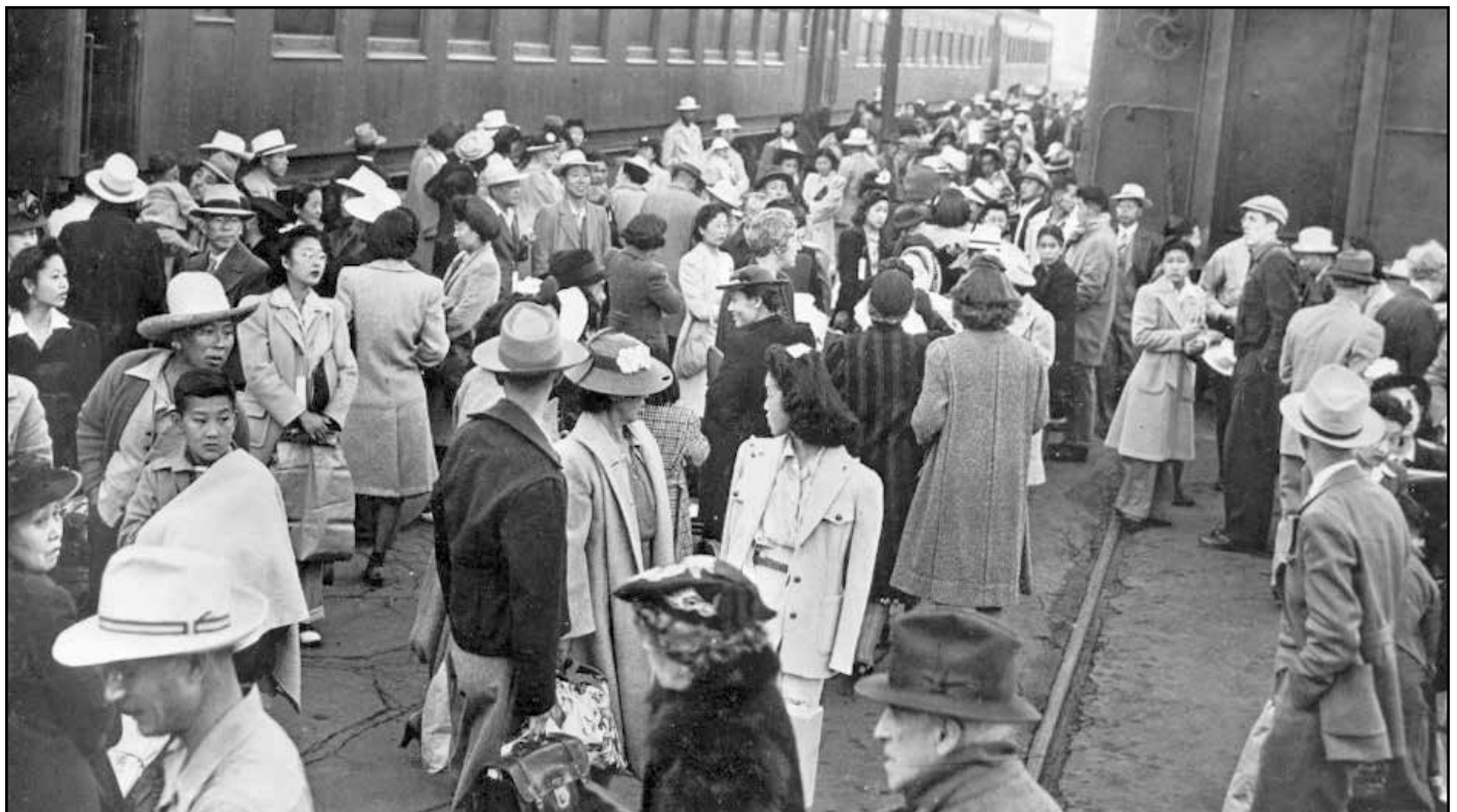
Japanese Americans at a Los Angeles train station during mass removal from the west coast in 1942.